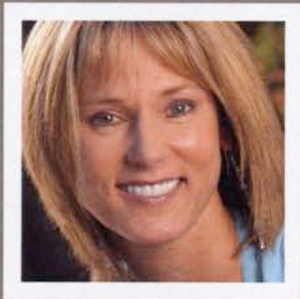
Hanna; procedures performed, neuromuscular dentistry and porcelain veneers